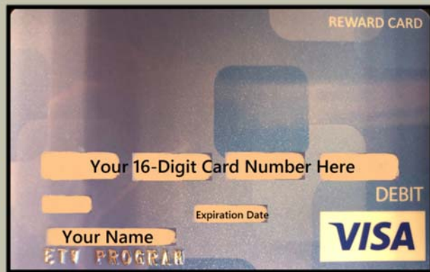
Example ETV Pre-Paid Debt Card

Stipends are reloaded onto your Brightwell Prepaid Card on the 1st day of each month. A request for a stipend must be submitted by your ILS by the 15th of the prior month. For example, ETV must receive the request for an April stipend by March 15th in order for it to be reloaded on April 1st. If the request for a stipend is received after the 15th, it will not be reloaded on the 1st of the next month, but the month after that. For example, if the request is received March 16th, the card will be reloaded on May 1st.